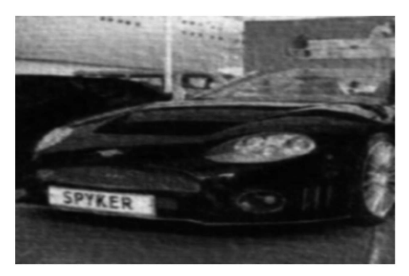
Fig. 4. Output image of high-speed acquisition system of blurred image information based on FPGA and USB

As can be seen from Figs. 4–6, the high-speed acquisition system of fuzzy image information based on FPGA and USB could barely display the license plate of the blurred image in the experiment under the same conditions. But in the complex fuzzy image, it could be seen as invalid display. Therefore, on the basis of guaranteeing the display level, the high-speed acquisition system of the fuzzy image data based on FPGA and USB effectively improved the processing and storage efficiency of the system by using FPGA and USB. But the functions of the system were simple, so it was only suitable for fields without high demands for high-speed acquisition system