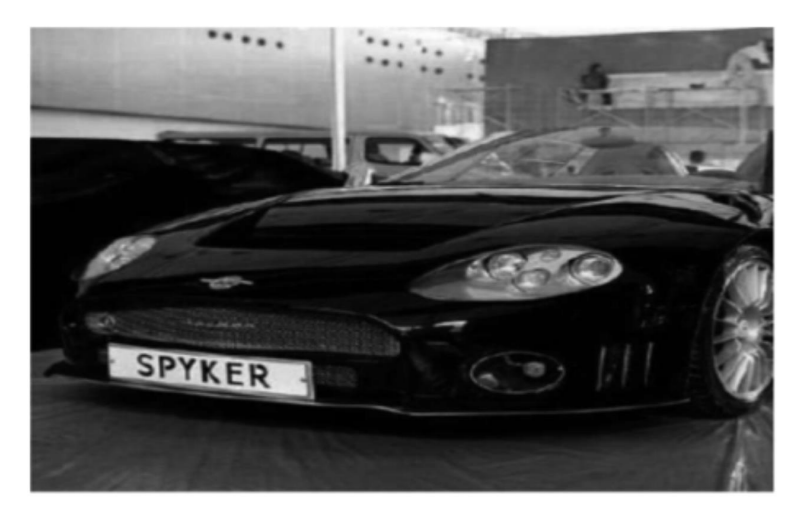
Fig. 6. Output image of the system presented in this paper

The experiment also used the prediction of the behavior of the cars in figure 4 by these three systems (the direction of the north was 0^{\circ} ), and analyzed the working