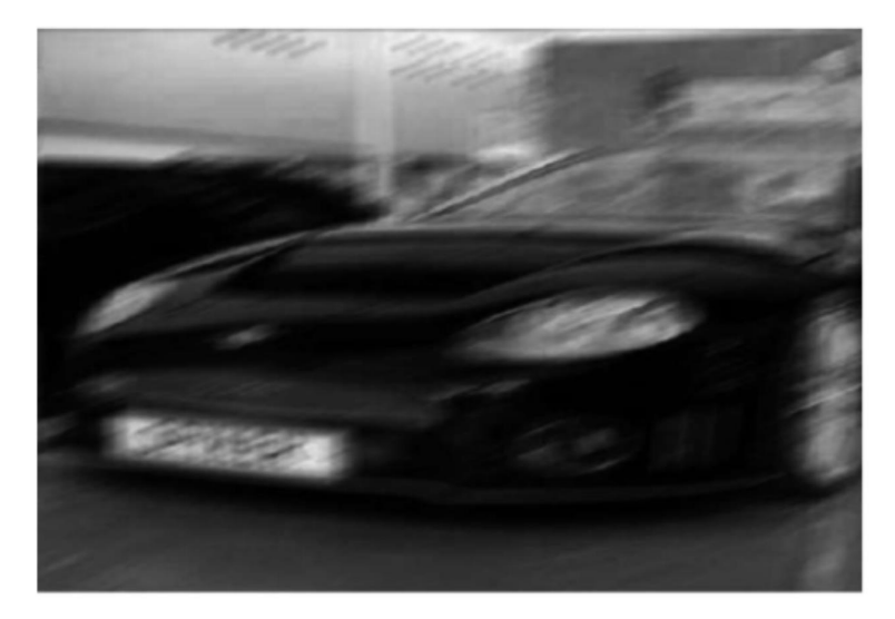
Fig. 3. Initial fuzzy image