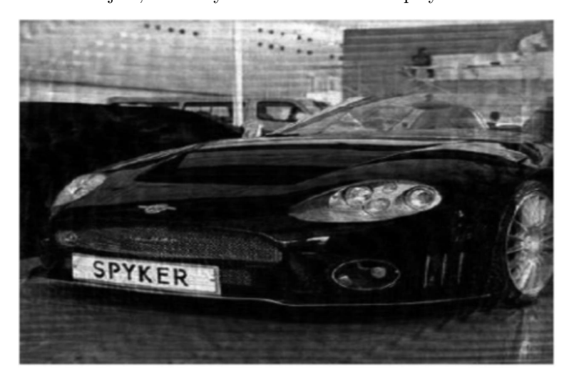
Fig. 5. Output image of high-speed acquisition system of fuzzy image information based on PXI bus

of fuzzy image. The high-speed acquisition system of fuzzy image information based on PXI bus had good display effects, but it carried out the design of display terminal for fuzzy image restoration, used the display processor optimization of acquisition high performance resources, and realized the display of high-level fuzzy image by the system. So the collection efficiency of this system still has more rooms for improvement. Compared with the two systems, the display effects of this system are closer to the real object, so the system has excellent display effects.